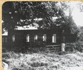
Carleton Parish Hall