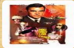
You only live twice