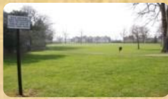
Spring 2009