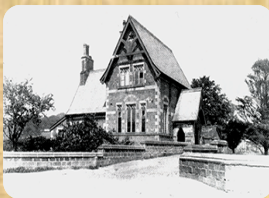
Old infant school (<1960's)

(now called the Rookeries Infant & Jnr. school)