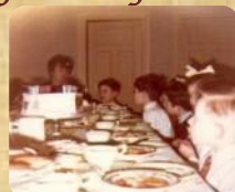
Home 2 birthday (who's was it?) I'm on left, middle?