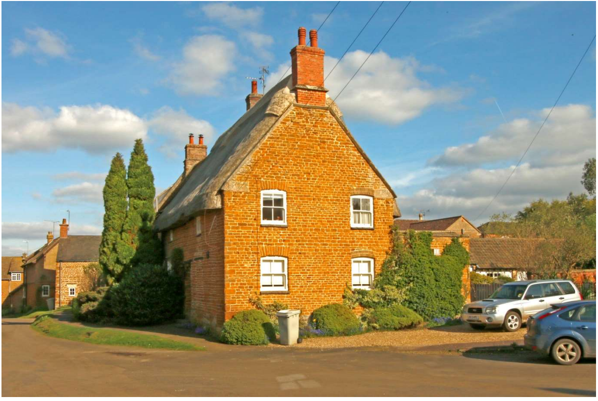
27 - PRESTON CROSS LANE (South Side) SK 8602 and SK 8702