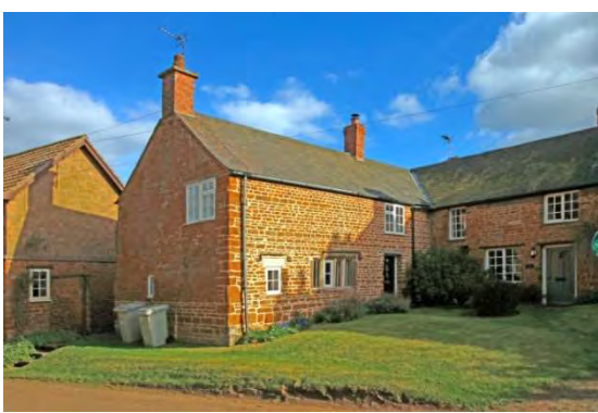
Garden picture from Rightmove