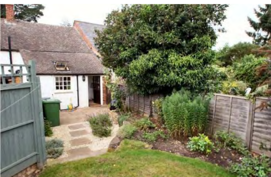
Interior and Garden Pictures from Zoopla