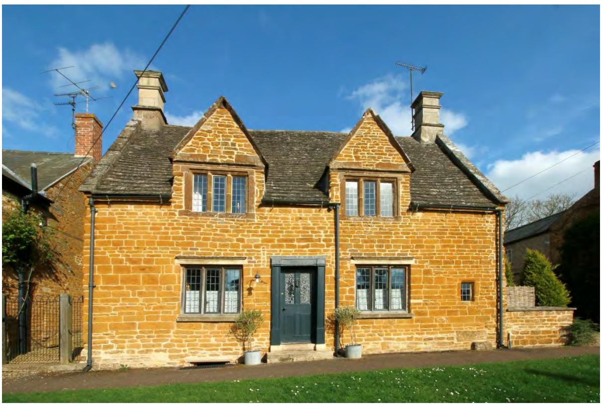
10/12 - PRESTON MAIN STREET SK 8602 and SK 8702 4/10