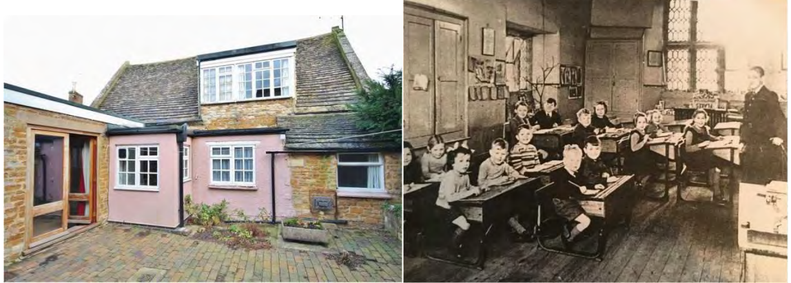
Garden and Old Picture