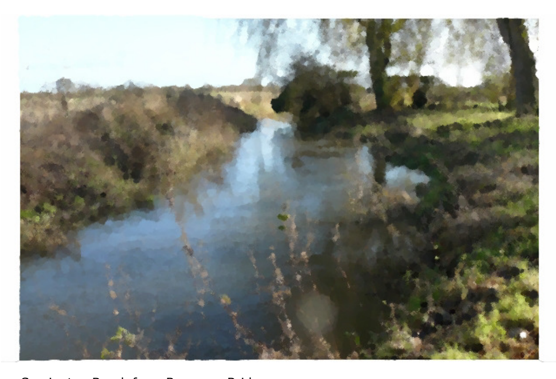
Semington Brook from Brasspan Bridge - digitally rendered watercolour