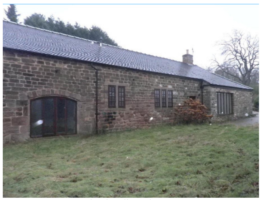
Bleach Mill. Wash Green

In the latter years of the 19th century, the weekly output of 230 people employed at Speedwell and Haarlem Mills in Wirksworth equalled the circumference of the earth. Under the broad description of tape makers these workers were producing a wide range of narrow fabrics, from boot laces to ferrets (stout cotton or silk tapes) and smallwares (haberdashery), they also produced the red tape for Whitehall.