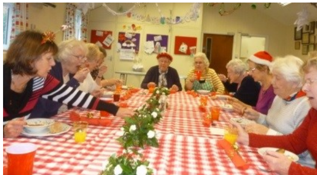
It always ends up with the washing up!!!!