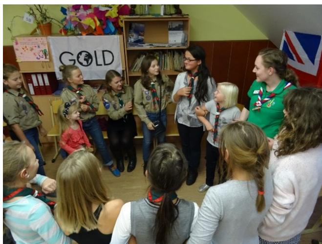
Playing International Connect with Marupe Brownies