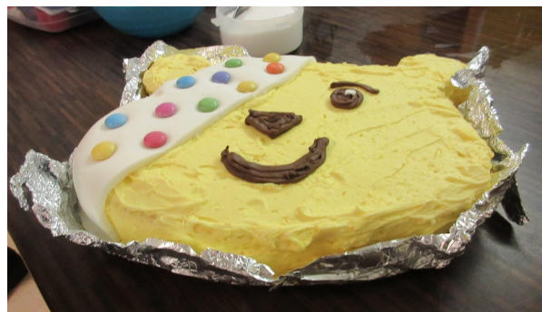
Pudsey Bear was one of the many home made cakes

10th Burgess Hill Brownies had great fun raising money for the Children in Need Appeal again this year. They displayed a vast array of great skills at a talent show, to which parents were invited, and this was followed by a sale of many different items and refreshments, raising money for Children in Need.