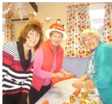
Crafting crackers for the table.