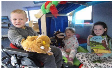
P4B enjoyed reading to the Early Years children.

World Book Day was great fun as we had a Big Bedtime Read and we all came to school in our pyjamas