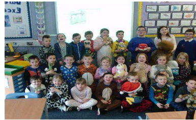
Primary 1B had fun reading with P5b