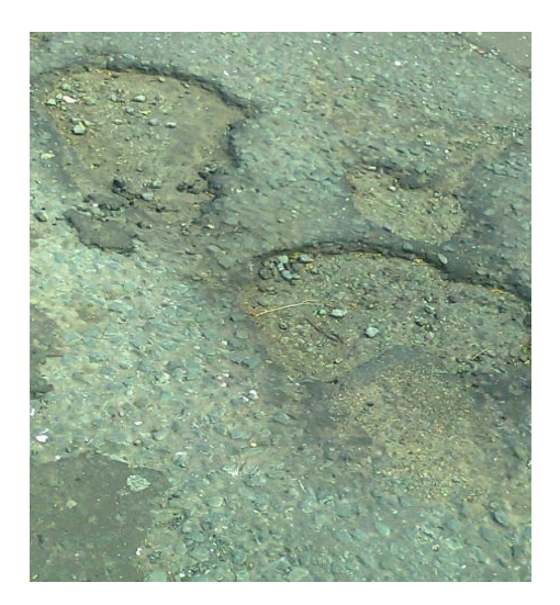
Litter bin at bus stop at dentist Oxgangs Road North and Potholes in Colinton Mains, 12/09/18