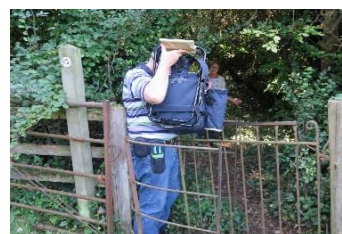
How to tackle a stile in style