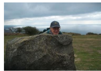
A pair of old fossils