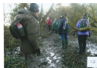
Stop wallowing and get a move on