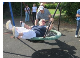
Swing me low