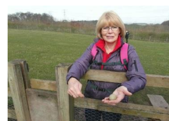
I don't like the look of this