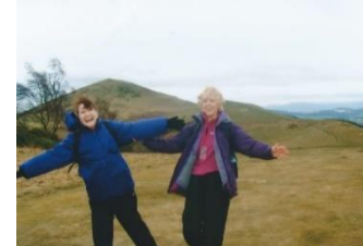
Castle Brom hand gliding club