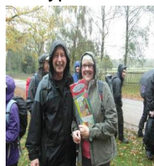
15 th Century Baddesley Clinton Warwickshire

November was an exemplary month for walks. 5 took place providing real variety of length, location (5 different counties were visited) and environment. They ranged from 5 to 8.5 miles from flat to hilly and in a mixture of weather. Three of them – the 1 st , 3 rd and 5 th took in National Trust property, again of very different types.