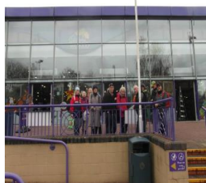
Urban parks Bournville West Midlands