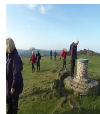
Ancient rocks Beacon Hill Leicestershire