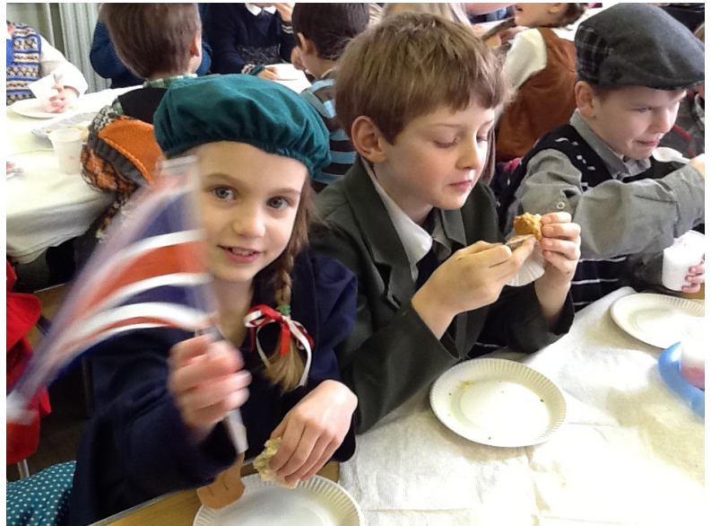
World War II Street Party at Merriott First School