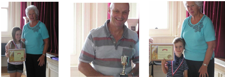
Three of the lucky winners!

On Saturday 10th August the Gardening Club held their annual Flower & Produce Show in glorious weather! Despite the lack of rain in the previous months and the late frosts, the standard of the exhibits were very good and the Gardening Club would like to thank all those exhibitors who took part, without whom the event could not take place - so, a big thank you to one and all!