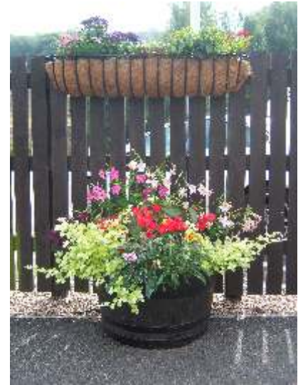
Flower power at Ambergate.

Our 'Brightening Up Derwent Valley Line Stations' project had a significant impact along the whole line, receiving notable praise from passengers. This project was funded by both the Designated Community Rail Development Fund and ACoRP's Small Grant Fund. The stations look stunning as a result of this project, especially Ambergate and Cromford, which had no existing planters or managed station gardens area, prior to this project. There are now over 80 mini gardens in the form of platform planters, barrels and flower baskets adorning the seven stations.