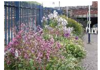
Station gardens in bloom.

Outstanding Volunteer Contribution for 2013. All three awards are proudly displayed at the station. These awards generated several news articles in the Belper News and Derby Evening Telegraph. Station volunteers and members of the Rail Partnership also took part in a BBC TV East Midlands Today feature and BBC Radio Derby interview about the value of volunteering , as part of National Volunteer Week.