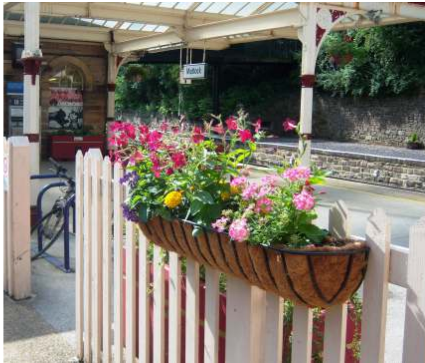
Flower baskets at the station entrance.

These awards reflect the success of the Visitor Information Point , integration of Peak Rail's services and the continuing enhancements to the station by East Midlands Trains and Friends of Matlock Station. The, already excellent, floral displays were enhanced in summer 2013, by the addition of four flower baskets on the station entrance fence and hanging baskets from the canopy roof.