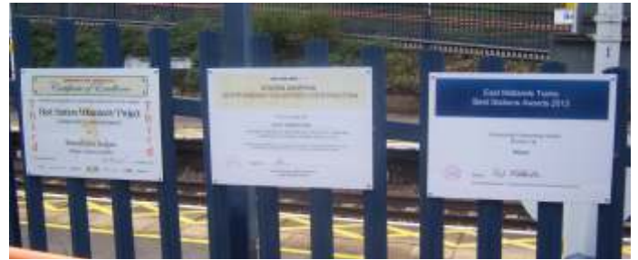
Trio of awards recognising improvement to the environment at Belper Station.