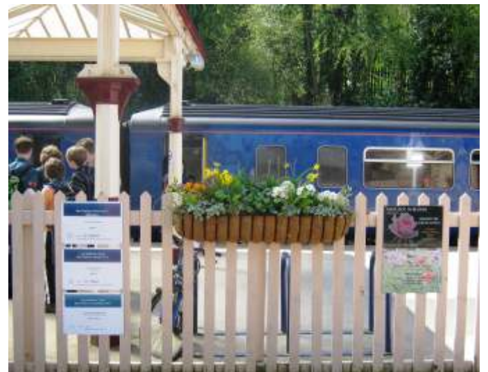
Matlock's numerous awards on display at the station.