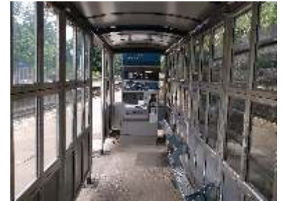
Ticket machine inside the new shelter.

The Partnership welcomed the start made in February to improve passenger facilities at Belper, especially those to enhance use of the ticket machine. East Midlands Trains installed new waiting shelters on both platforms. This included repositioning the existing Ticket Vending Machine inside the new, larger shelter on Platform 2, where passengers await trains for Derby and Nottingham. This has greatly improved passengers' experience of buying tickets. Previously, passengers had to either queue in the rain to buy tickets or struggle to read the screen due to the sun, which not only dazzled the screen, but caused it to fade. New seats have been installed on Platform 1. As part of the station improvements Network Rail have agreed to replace the partially collapsed wall, adjacent to the new shelter on Platform 2, an improvement the Partnership and station volunteers have been requesting for some time. The Rail Partnership obtained a grant from the Designated Community Rail Development Fund towards these improvements, part of which can be used by Transition Belper to plant behind the new wall.