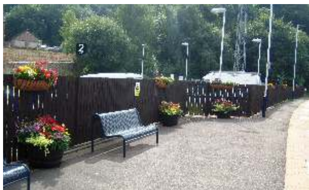
Barrels and flower baskets adorning Ambergate Station.

Three new Station Adopters have been making a great difference at Ambergate taking on the planting and care of 6 planting barrels and 11 flower baskets along the platform and around the station car park. The platform is now a colourful and welcoming display of flowers and has received many positive comments, including a thank you card regarding the floral display, received from a lady from Derby.