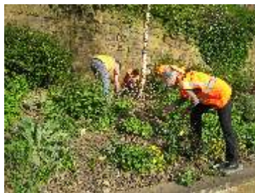
Volunteers tending the gardens.

The transformation of Belper Station Gardens has continued apace with ever increasing numbers of volunteers progressing Transition Belper's station gardening project. The group's fantastic work was recognised with three awards in as many months. Community Partnership working was recognised with a Runner-Up award by East Midlands Trains and a third place in the Best Station Volunteers' Project at the Community Rail Awards.