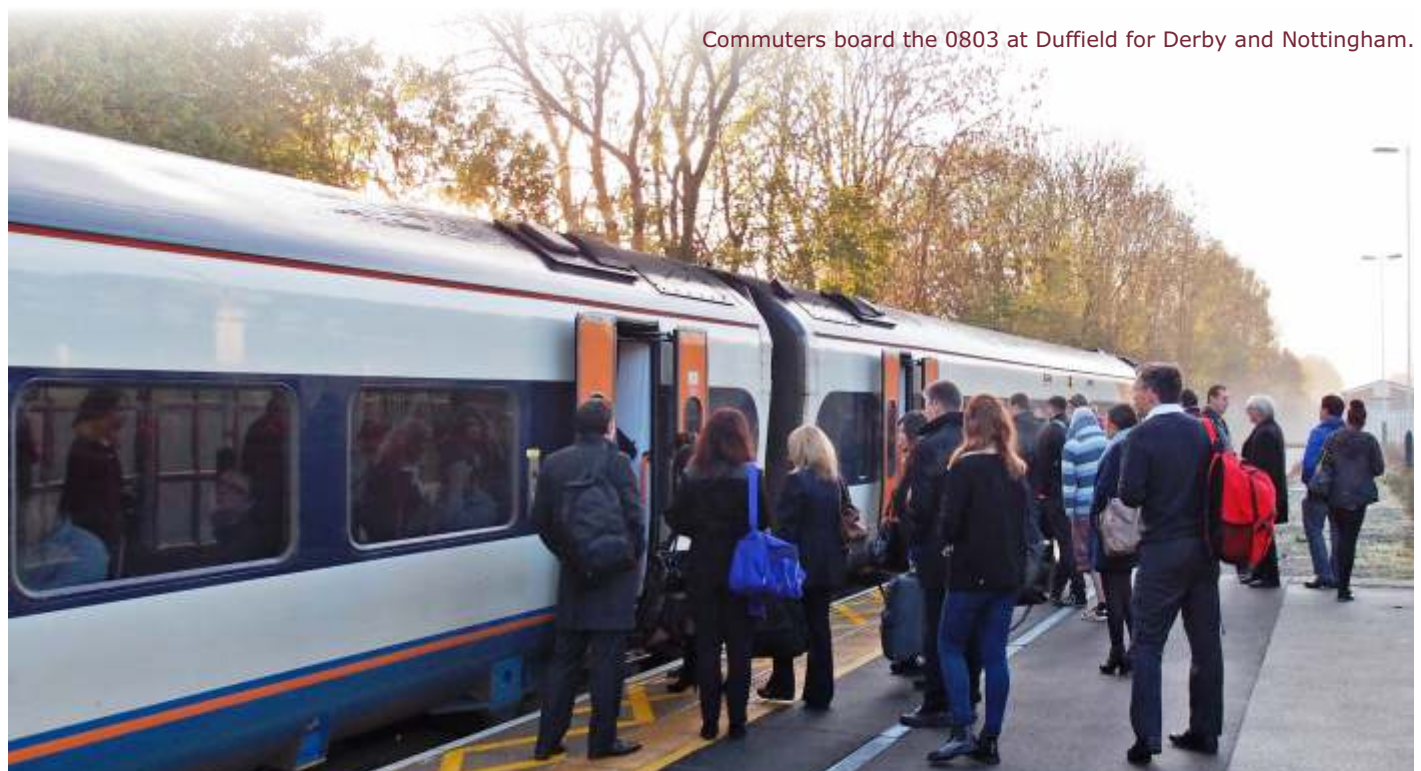
Commuters board the 0803 at Duffield for Derby and Nottingham.

Over nine out of ten Derwent Valley Line trains ran on time during the year. Punctuality and reliability did dip slightly from the previous year high of 93% to 90%. Punctuality on the Derwent Valley Line was particularly affected in February, due to mainline train alterations, caused by the impact of the landslip at Unstone, near Chesterfield.