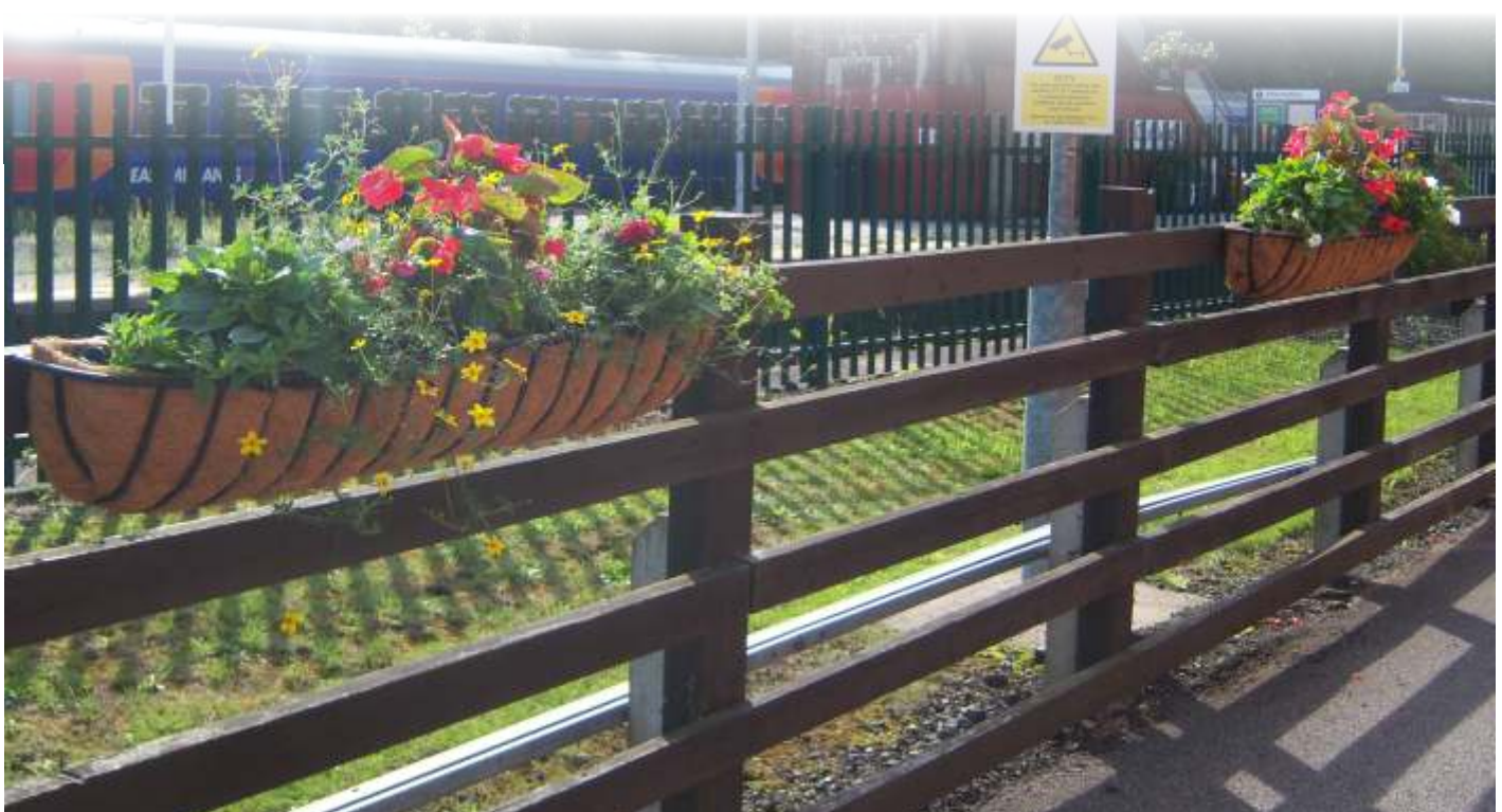
Flower baskets along the entrance path to Duffield Station.

The small team of station adopters helped to install, and are now looking after, five new flower baskets along the entrance path to the footbridge. An impressive floral display welcomes passengers walking to the station, complementing the existing platform planters around the footbridge. The new flower baskets formed part of the 'Brightening Up Derwent Valley Line Stations' project.