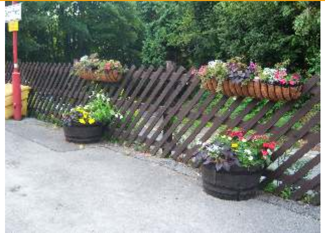
Some of the new barrels and flower baskets at Cromford.

event, between the team of Directors and Derby Station Management, took place on 3 May 2013. This new event saw the Directors team carrying out clearance of the approach road banking, whilst the Derby Station team created a new planting area in the car park. The project was supported by Network Rail and plants for the project were donated by Neil Thompson Nurseries of Tansley. Donated Polyanthus plants were also planted following the event. Photographs from this enjoyable and successful day were entered into the photographic competition for Community Rail People in Action at the Community Rail Awards. The judges were suitably impressed choosing the 'Cromford Teams Unite' photograph as the winner of the award. See the front cover for this award winning photograph.