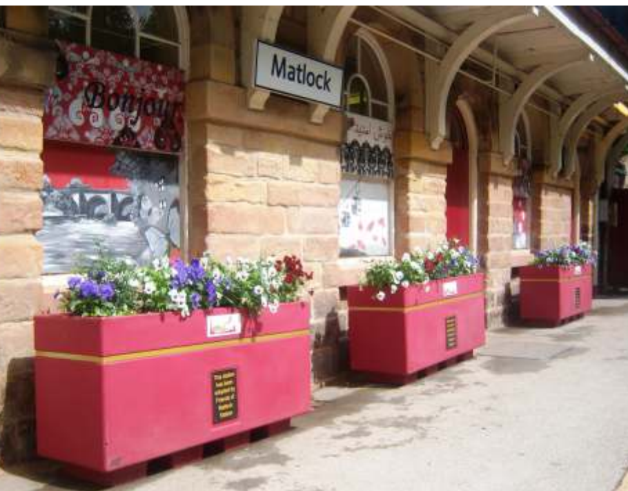
Flower planters along the platform at Matlock.

Funding raised by the Friends of Matlock Station enabled the purchase of a new hose reel trolley to make watering at the station much easier, to complement the upgraded water supply within the Peak Rail building, which they had also worked to fund. Peak Rail kindly continue to allow the volunteers free use of their water supply.