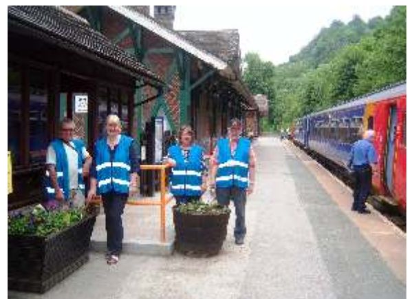
Station volunteers with their new planting tubs at Matlock Bath.

Artwork produced by children from Matlock Bath Holy Trinity Primary School was unveiled around the interior of the waiting shelter. The series of scenes depict local tourism attractions and places of interest in Matlock Bath.