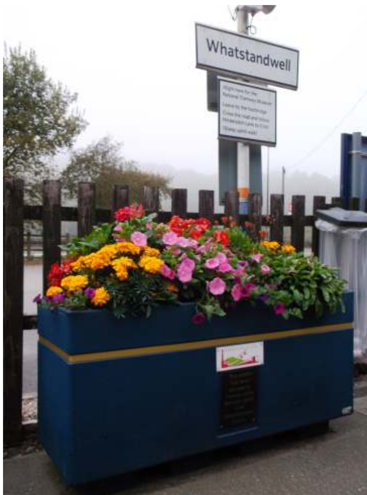
Above: A colourful display brightening up a misty morning.