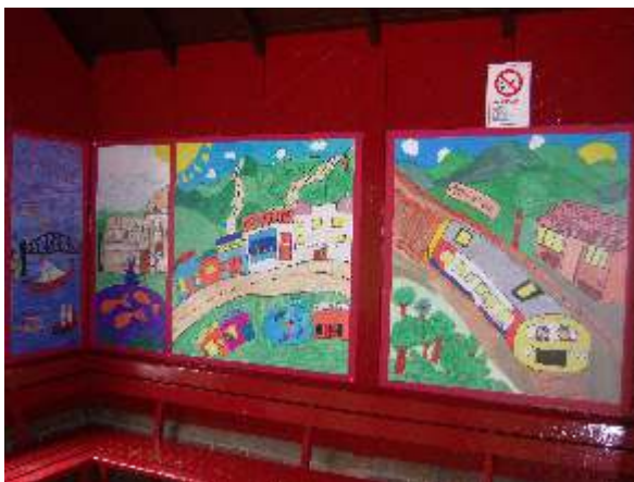
Children's artwork adorning the station waiting room.

During the year, concerns grew about the safety of some of the trees along the Station Approach Road. Following discussions with Network Rail and Derbyshire Dales District Council one large tree was felled and branches deemed to be dangerous, removed from a number of other trees. Initial discussion has taken place regarding future proposals for tree management.