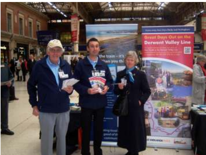
Promoting the Derwent Valley Line at London Victoria.