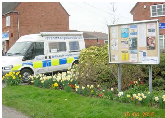
Wellesbourne Police Station in the Spring