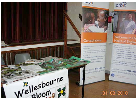
Orbit Heart of England Easter Residents Open Day