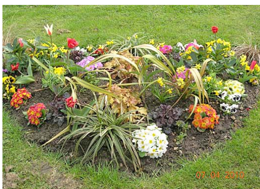
Newbold Road Bed