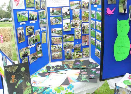
Walton Fete – WIB Exhibition