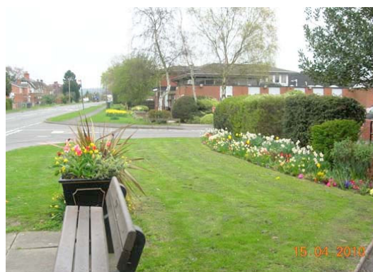
Library before the demolition in spring