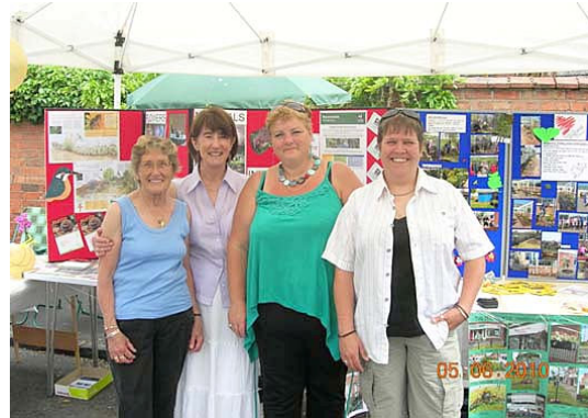
Wellesbourne Annual Street Fair 2010