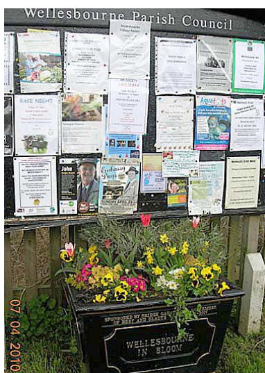
Village Notice Board Planter