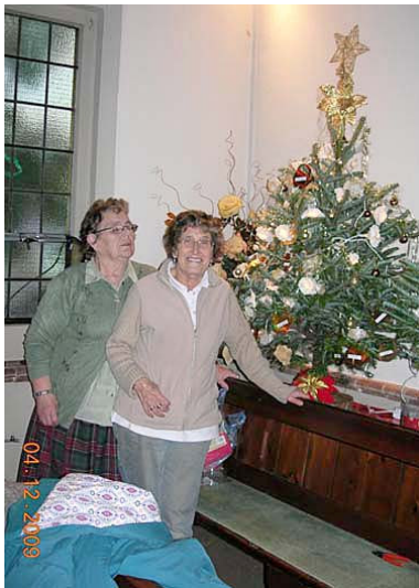
Two Blooming Fairies by the Bloomingold Tree