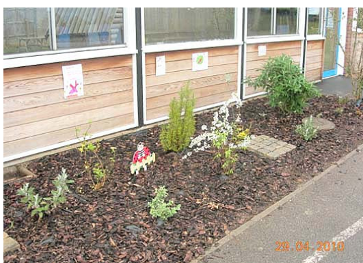
New School Annex garden