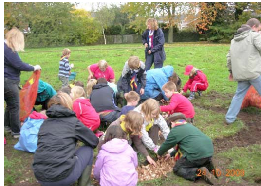
Trefoil planting turmoil