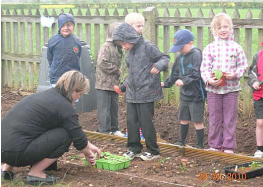
School Gardening Club- Planting in the pouring rain