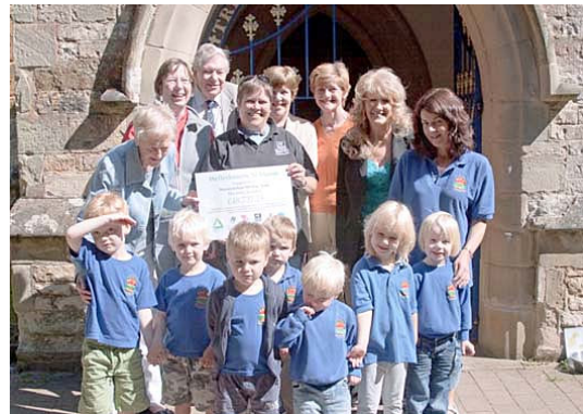
“We’ve got it” grant celebration photo