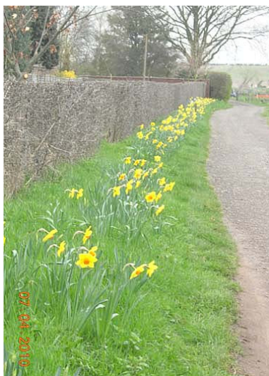
Allotments site of extensive wild flower seed planting