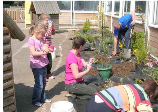
School Annex garden makeover