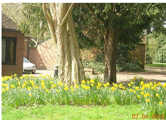
Church Centre site of new wildlife project.