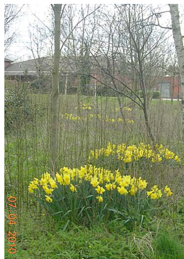
Mountford Copse site of wildflower planting