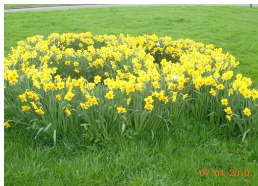
Brownies Trefoil in Bloom