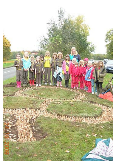
Rainbows and their Trefoil