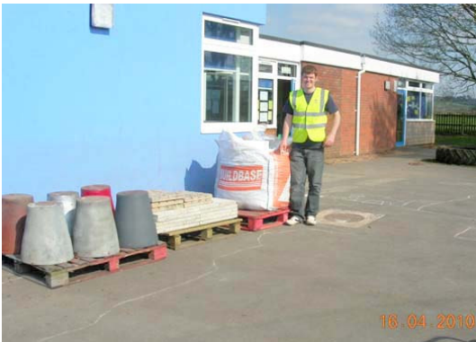
Part of the EFG Expo Flora delivery