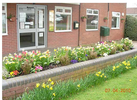
Medical Centre Planter and bulbs