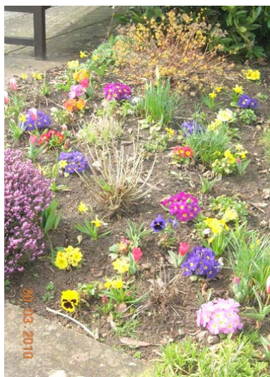
Farrington Court Spring Bed