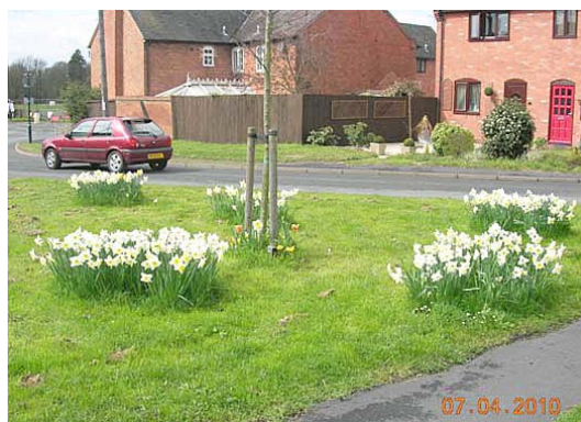
Village Centre in spring