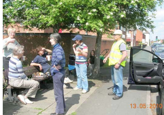
Library clearing – refreshments needed mammoth job