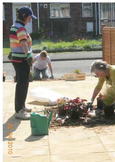
Hastings Road Project