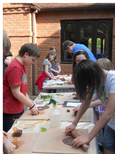
Church Centre artist workshop