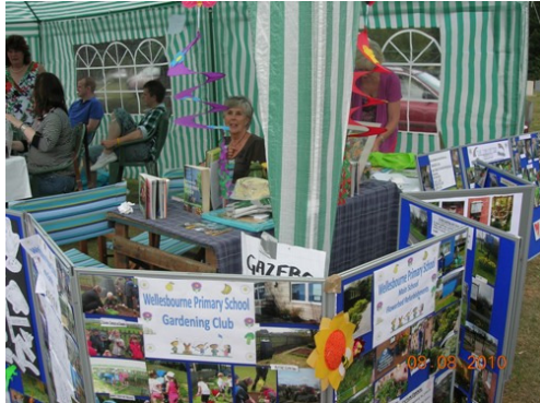
Walton Fete – WIB Exhibition