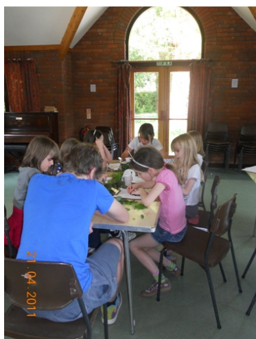
Church Centre artist workshop