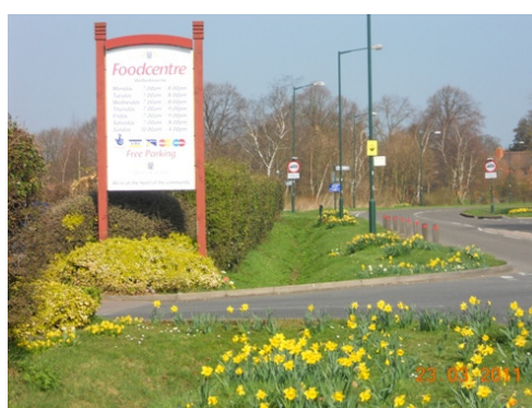
Approaching the village