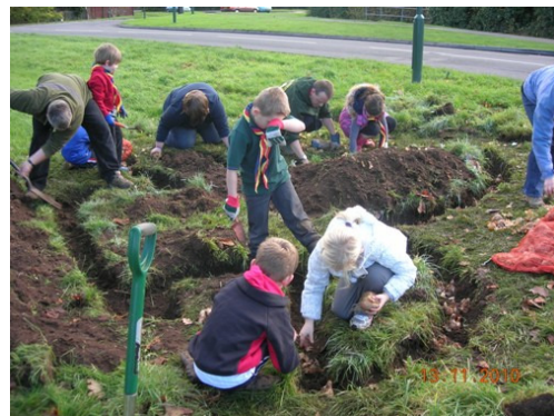
Trefoil planting turmoil