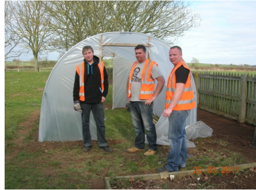
New School Annex garden