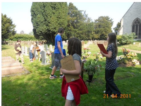
Church Centre artist workshop