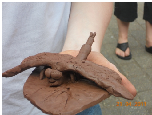
Church Centre artist workshop