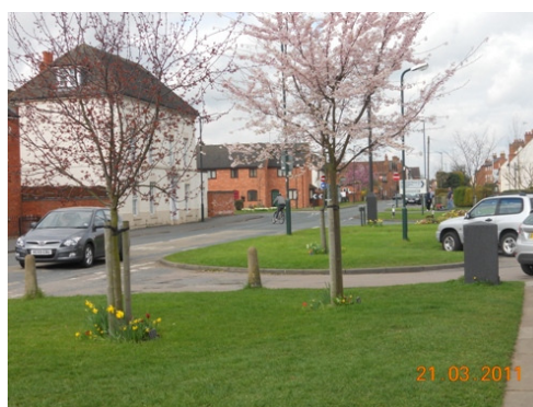
Village Centre in spring