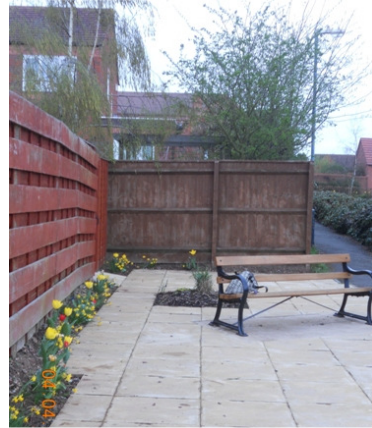
Hastings Road Project