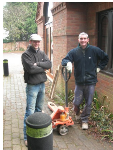
Church Centre site of new wildlife project.