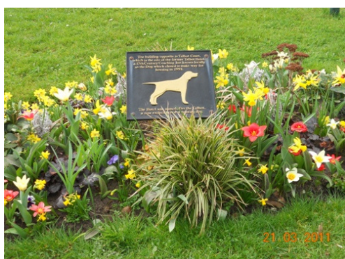
Dog Bed in Spring