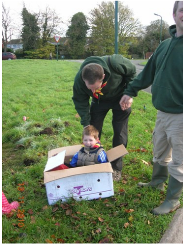
“Cub” in a box