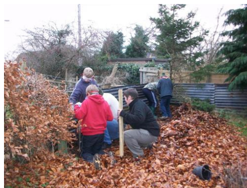
Church Centre site of new wildlife project