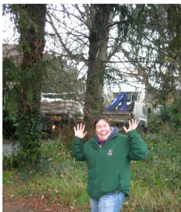
Crazy to Work With WIB