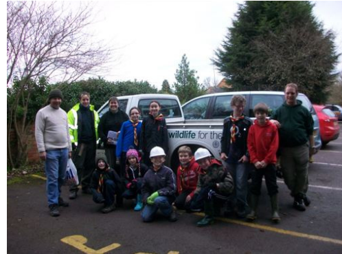
Church Centre site of new wildlife project.