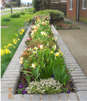
Medical Centre Planter and bulbs