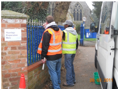
Probation Service Painting Work