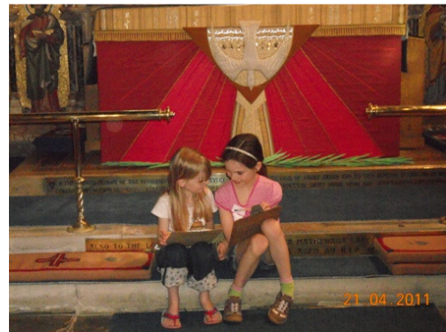
Inspiration Art in Church