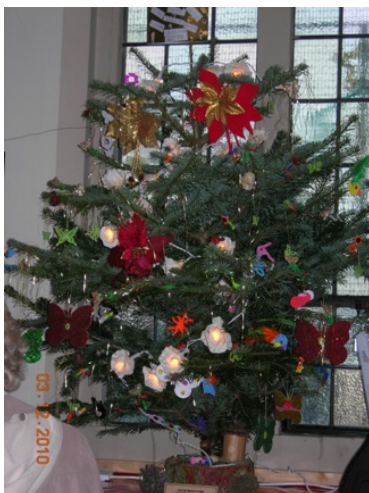
Methodist Church Xmas Tree Festival