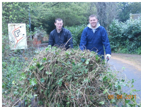
Church Centre site of new wildlife project