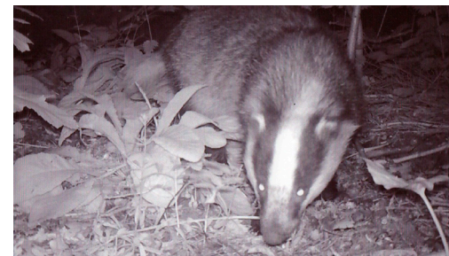
Page 11: Top , New vixen with cub. Fox cub practising hunting techniques. Bottom , Badger visiting sett.