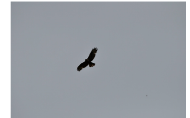
Buzzard over Hothfield Common

The heathland is open to all, including dogs kept in check. Various trails are signposted and indicated on the maps at entrances, which also give the location of the livestock. The noticeboard down the main slope from the Cade Road car park gives recent wildlife sightings. For email alerts on the location of the livestock, or to join the volunteers who help maintain the reserve, check the cattle and carry out summer surveys contact the Warden on 01622 662012 or at ian.rickards@kentwildlife.org.uk . Ian Rickards