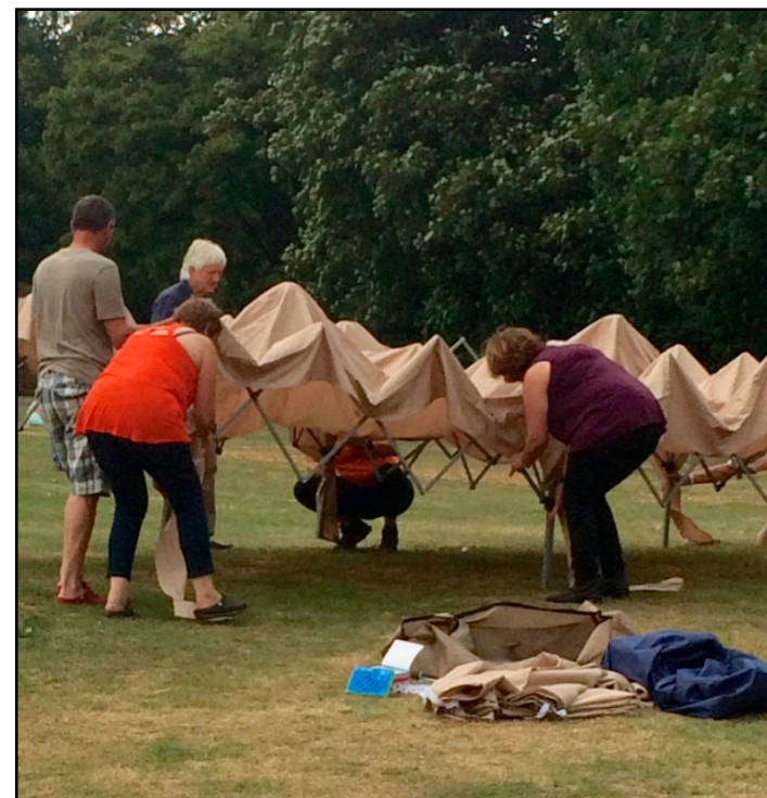
Getting ready for the fête: How to put up a gazebo!

8th September 10th September 17th September 25th September 30th September