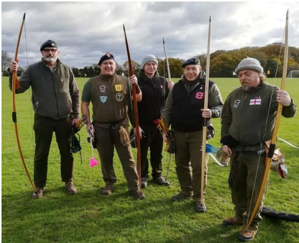
The Kettering boys - always a joy to be on a field with

not a day for left-handers shooting BB or LB or even Rec without a clicker