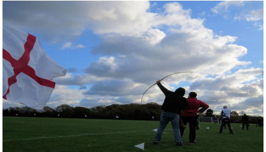
Stunning cloud formations