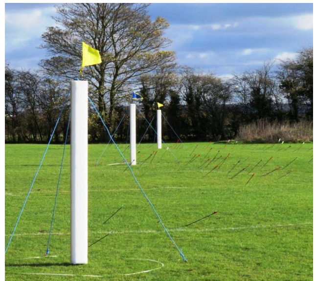
must have killed quite a few worms over the day!