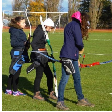
our three Junior Lady Barebowers enjoying the day