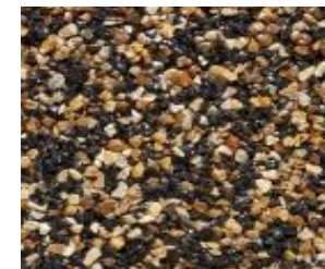
Stone Age Bronze – the chosen colour

We are pleased to confirm that the first phase of path resurfacing with 'Flexi Pave' will commence in September (for approximately one month) on the area between Dock Road and Julius Court (See map above).