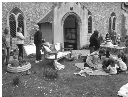
Messy Church at Barnham