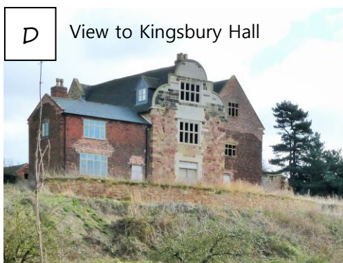
D View to Kingsbury Hall