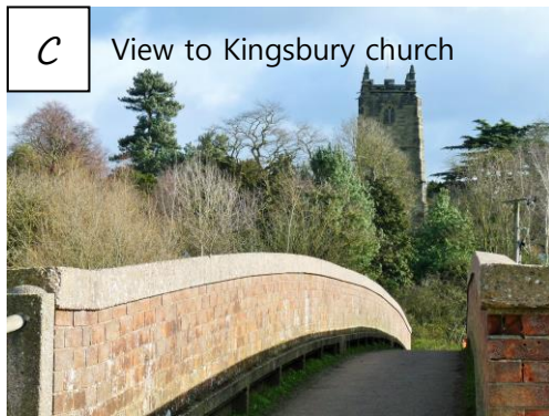
C View to Kingsbury church