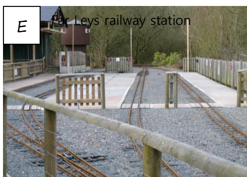
E Far Leys railway station