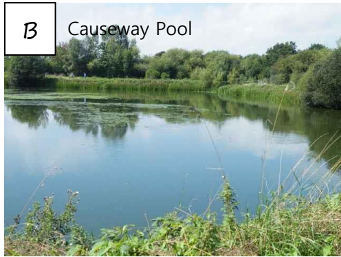
B Causeway Pool