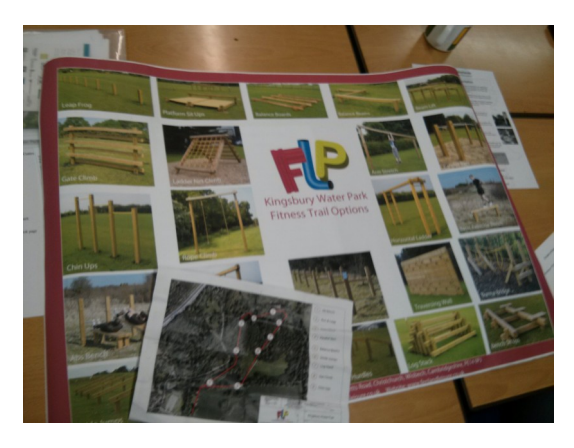
Various types of exercise items.

The project will restore natural river processes to the River Tame at Kingsbury Water Park by altering the profile of the current incised river banks and widening the river. This will allow the natural development of riffles which will not only improve habitat and have a beneficial impact on wildlife, but will also increase oxygenation of the river. This will contribute to water quality improvement targets as set out under the FU Water Framework Directive (WFD) and the Environment Agency Humber River Basin Management Plan. The spoil from the river re-profiling works will be used in Hemlingford Water to shallow the eastern edges of the lake, where a reed bed (a BAP priority habitat) will be created at a later date which will help to protect the lake margin from erosion while providing valuable habitat for wildlife, that will also help to filter out nutrients from the lake.