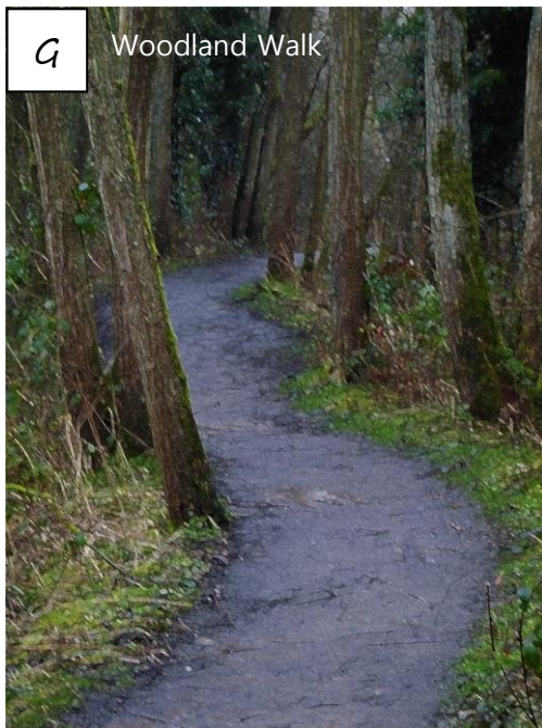
G Woodland Walk