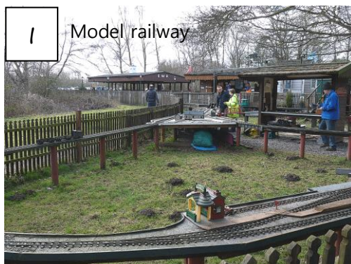
I Model railway

your right is often bright with water lilies and, if you stop for a few minutes and look carefully, you might spot a moorhen scurrying across the lily pads or a heron standing perfectly still at the edge of the lake, waiting for a tasty snack to swim by!