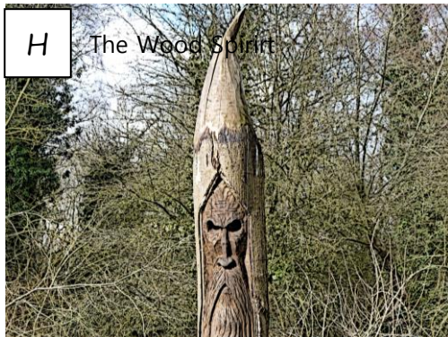
H The Wood Spirit