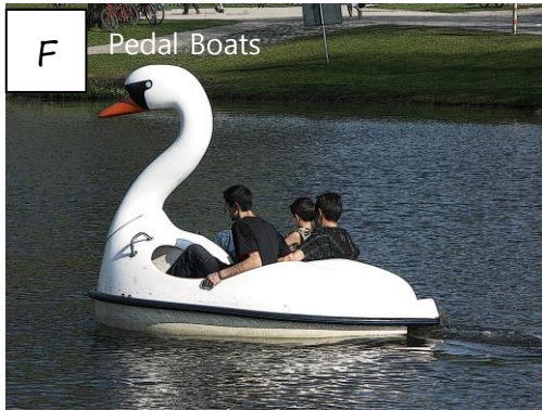
F Pedal Boats