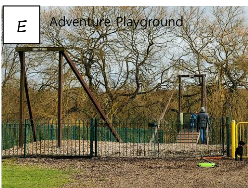
E Adventure Playground