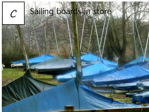
C Sailing boards in store