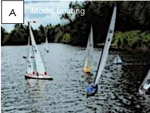
A Model boating