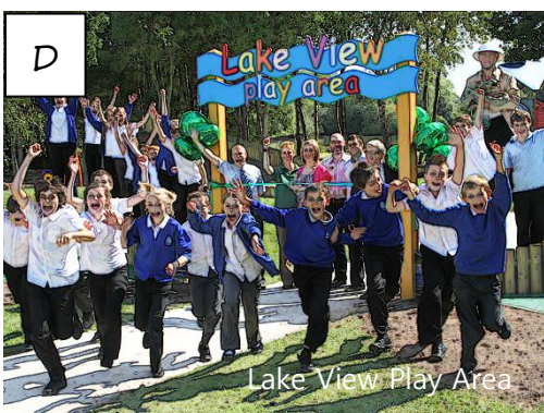
D Lake View Play Area