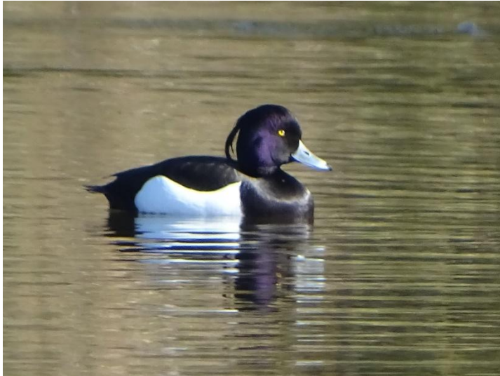
Male tufted duck

The male tufted duck is black with distinctive white flanks while the female is brown and less easy to identify. However, both male and female have the same bright, orange/yellow eyes and the same brilliant blue beaks.