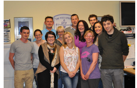
The Wellspring athletes... sorry team!

The Wellspring would especially like to say a big "THANK YOU!" to everyone who ran to raise money for us. Running a 10k is no easy task, it takes a lot of training, commitment and will power. The Wellspring had 25 people, ahem... athletes, running, with their efforts raising a total of over £12,000!!