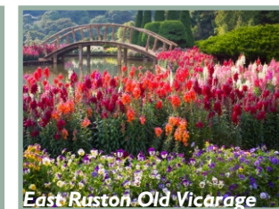
East Ruston Old Vicarage