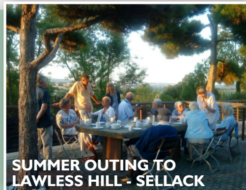
SUMMER OUTING TO LAWLESS HILL - SELLACK

Subscription £12.00 per member (Cheques payable to Ross Horticultural Society)