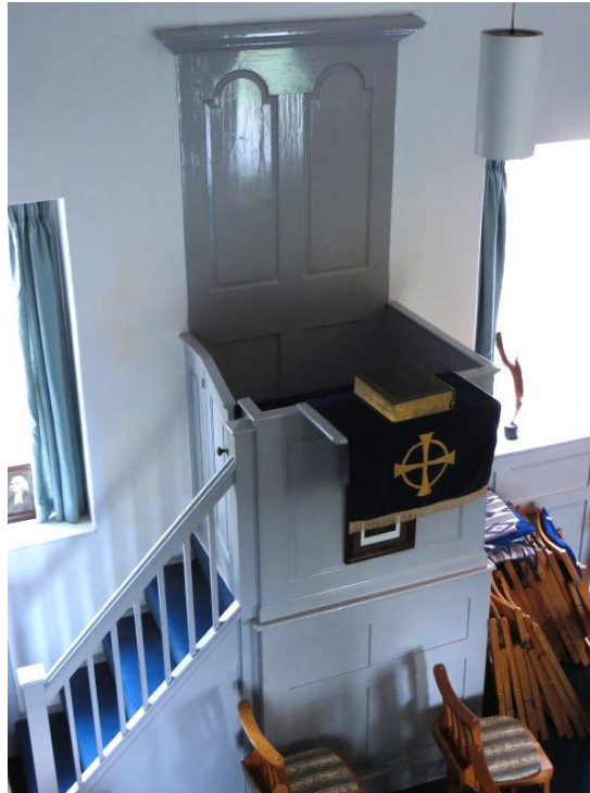
Wesley's pulpit in Winchelsea Historic Methodist Chapel