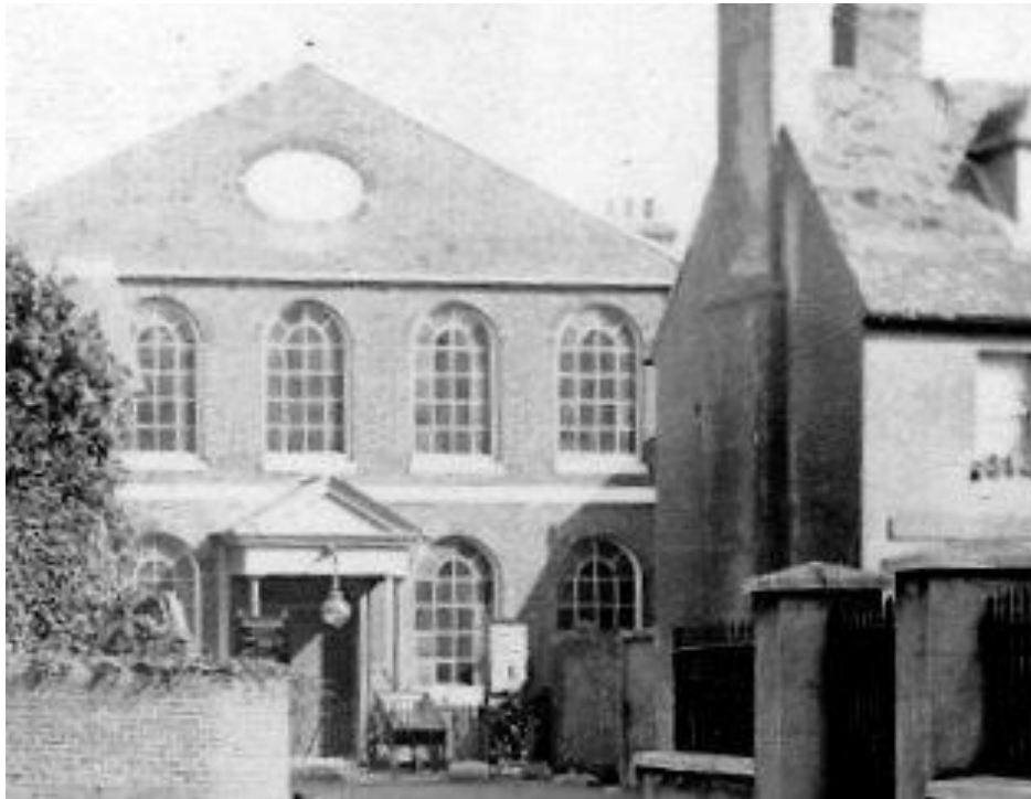
Rye's 1788 Methodist Chapel