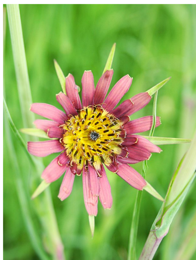
Tragopogon x miriabilis, a hybrid of Goatsbeard and Salsify.