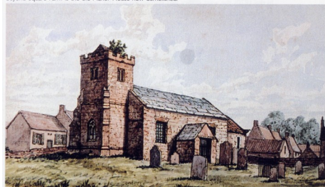
Lockton Church in the late 19th Century. In the background on the left is the first Primitive Methodist chapel which was replaced by the present Methodist chapel in 1899. On the right beyond Square Farm is the old Manor House now demolished.

the illustrations are available but we do not have a good quality copy of this picture. Does anyone have the original of this painting, a good copy or know who the artist is?