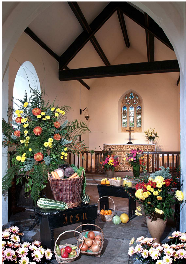
Inside St Giles' at the Harvest Festival

Parish Priest. Tel 01751 472983; email: vicar@pickeringchurch.com