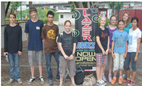
Laser Tagging With Friends In Manila