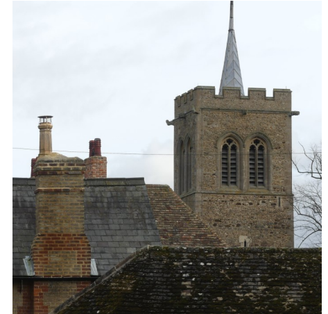
Gt Gransden - Jan 2018