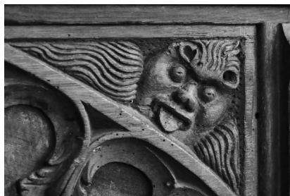
A "green man" carved on a pew front in Great Gransden