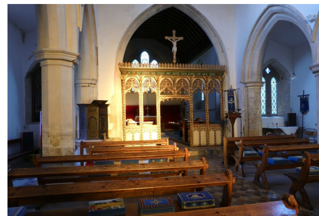
Little Gransden church interior from the south aisle