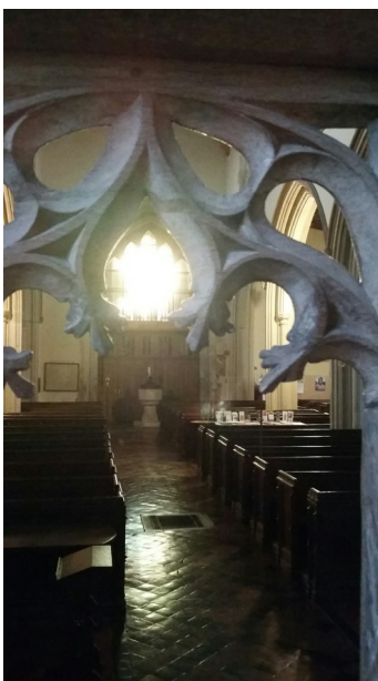
Gt Gransden church interior. Sunset through the tower window

Further information on all aspects of the parish's finances will be given in the statement of accounts for 2017 which is being issued separately at the Annual General Meeting.