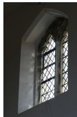
Refurbished clerestory window

We are grateful to all those who clean the Church and keep it and the churchyard maintained.