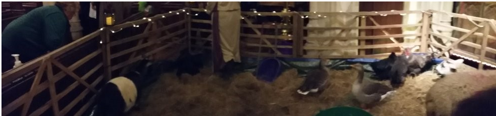
A pen was set up in front of the chancel arch for the Living Nativity service on the 24th December. Sheep, geese, chickens, a sheep dog a pig goats and a donkey were present.