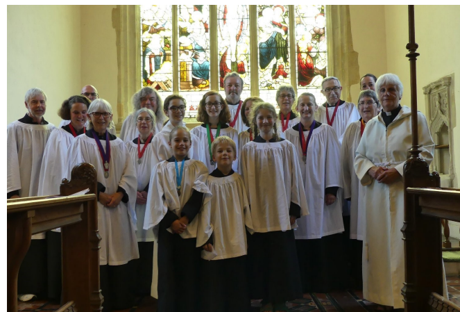
Music Sunday 2017 (see page 22)

Childline Telephone Number 0800 1111 http://www.childline.org.uk