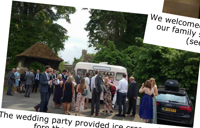
The wedding party provided ice creams for guests before the ceremony on the 2nd June.