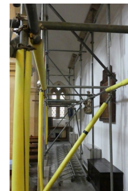
Scaffolding in the south aisle