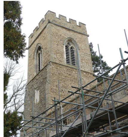
Lt Gransden - March 2018