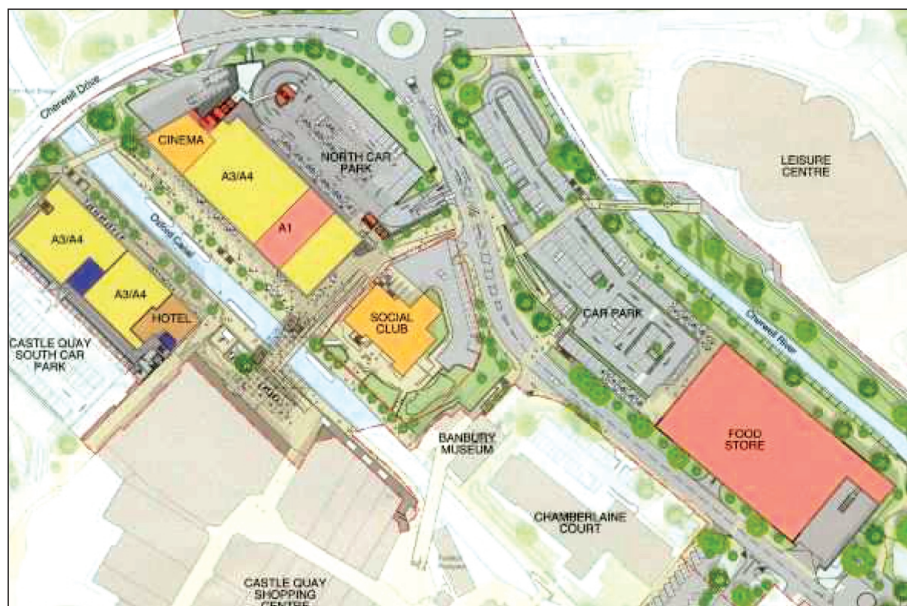
Revised Casle Quay extention plan as submitted

the Banbury Canal Partnership, the plans have been radically revised.