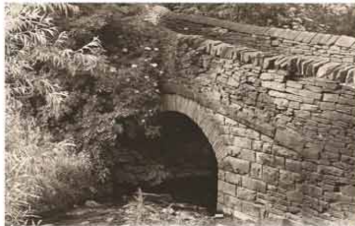
The former pack-horse bridge near Lower Putting Mill