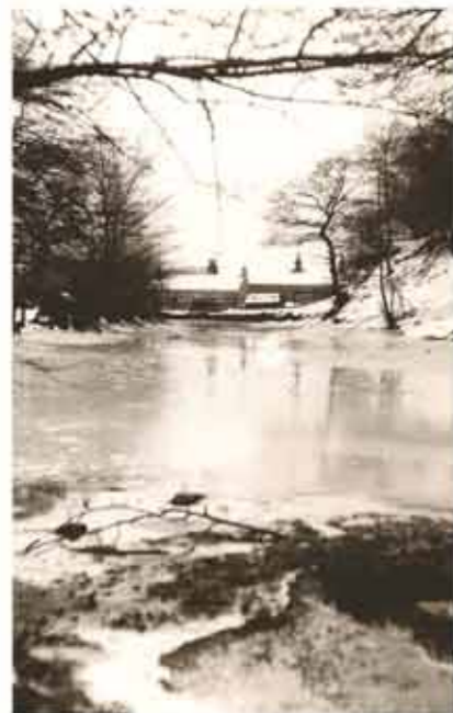
Lower Putting Mill: the former fulling mill and dam

At the main track (Denby Hall Lane) turn right, then left away from the buildings. Follow the path across the fields with Baycroft Wood on your left. Cross the stile and turn left down Pool Hill Lane. Take the right turn at Exley Gate, then follow the main road round to the left, down the hill on Common Lane. Take the first right to double back on yourself on Stubbin Lane. At the fork bear left down the hill towards the River Dearne. At the bottom turn right to follow the river course downstream to the stone bridge, a former pack-horse bridge since raised. The cottages ahead are at Lower Putting Mill, properly called Lower Pudding Mill, the site of a former fulling-mill and corn-mill.