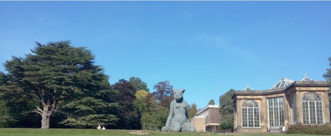
Yorkshire Sculpture Park

where there are many attractions and amenities which you might find difficult to tear yourself away from!