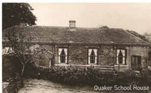
Quaker School House

The small settlement of High Flatts is set in attractive landscape at the head of the Dearne Valley, high on its watershed with the River Don. Its history and present character are intimately intertwined with the story of the community of the Society of Friends at Quaker Bottom. This picturesque cluster of stone buildings, many listed as of special architectural interest, is designated a Conservation Area.