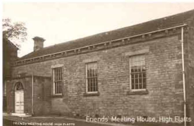
Friends' Meeting House, High Flatts

At the last stile turn right along the drive, between house and garden, and then over further stiles to descend to Strines Lodge. Just before the Lodge turn left over the stile and follow the return route via “forty steps”.