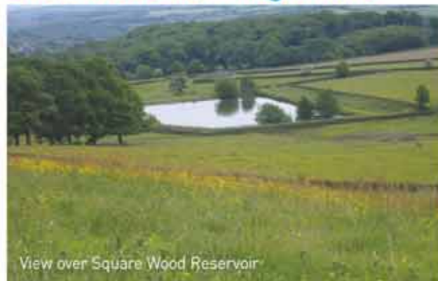
View over Square Wood Reservoir

Buses go to High Flatts from Huddersfield (Service 83, Huddersfield Bus Company – no Sunday service) and to nearby Ingbirchworth and Upper Denby from Penistone (Services 24 and 29, 9 buses per day; 6 on Sundays).