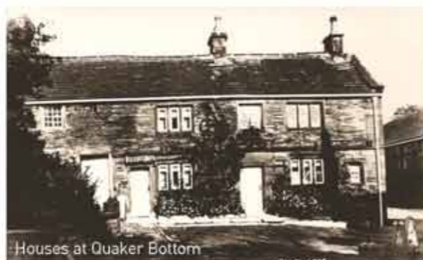
Houses at Quaker Bottom

Here you may continue the Short Walk—or switch to the longer walks. (see below)