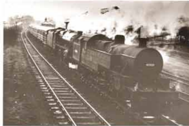
"The last steam-train [an excursion-train] to leave Clayton West, August 1963"

Follow the wood edge then bear right across the field path. Go under the railway and up the narrow path to meet Pilling Lane once again. Turn right and retrace your earlier footsteps along Elm Street, Queen Street and Commercial Road, back to the Council Offices.