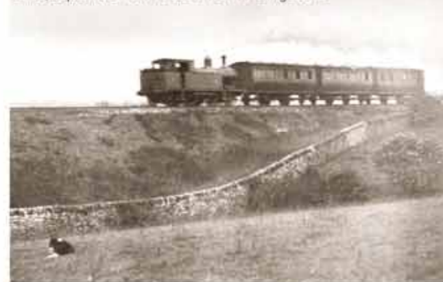
The first train on the Clayton West Branch Line, September 1879. Taken from Pilling Lane.

"Pilling" means the removal of bark for leather-work and it is thought there may have been a tannery in this vicinity. You will eventually see the Kirklees Light Railway on your left, with Cuckoo Nest Halt nearby.