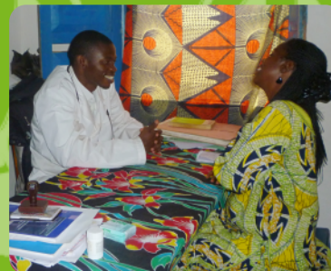
Hospital consulting room