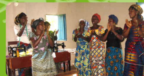
Beneficiaries of the Loan Fund

QCP funded counsellor training by HROC and THARS, two trauma organisations with close links to Quakers. QCP funds also enabled the completion of a small Trauma Clinic (TCPG) that contains two bedrooms, consulting/interview rooms and an office. QCP pays for school fees, sports and creative activities for 27 children and teenagers orphaned by violence. With more funds we could support more children! We are ensuring that the voice of the traumatised child is expressed and heard.