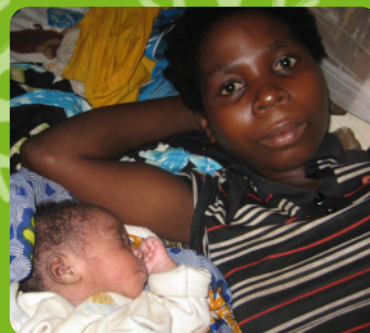
Young mother and child in hospital labour ward