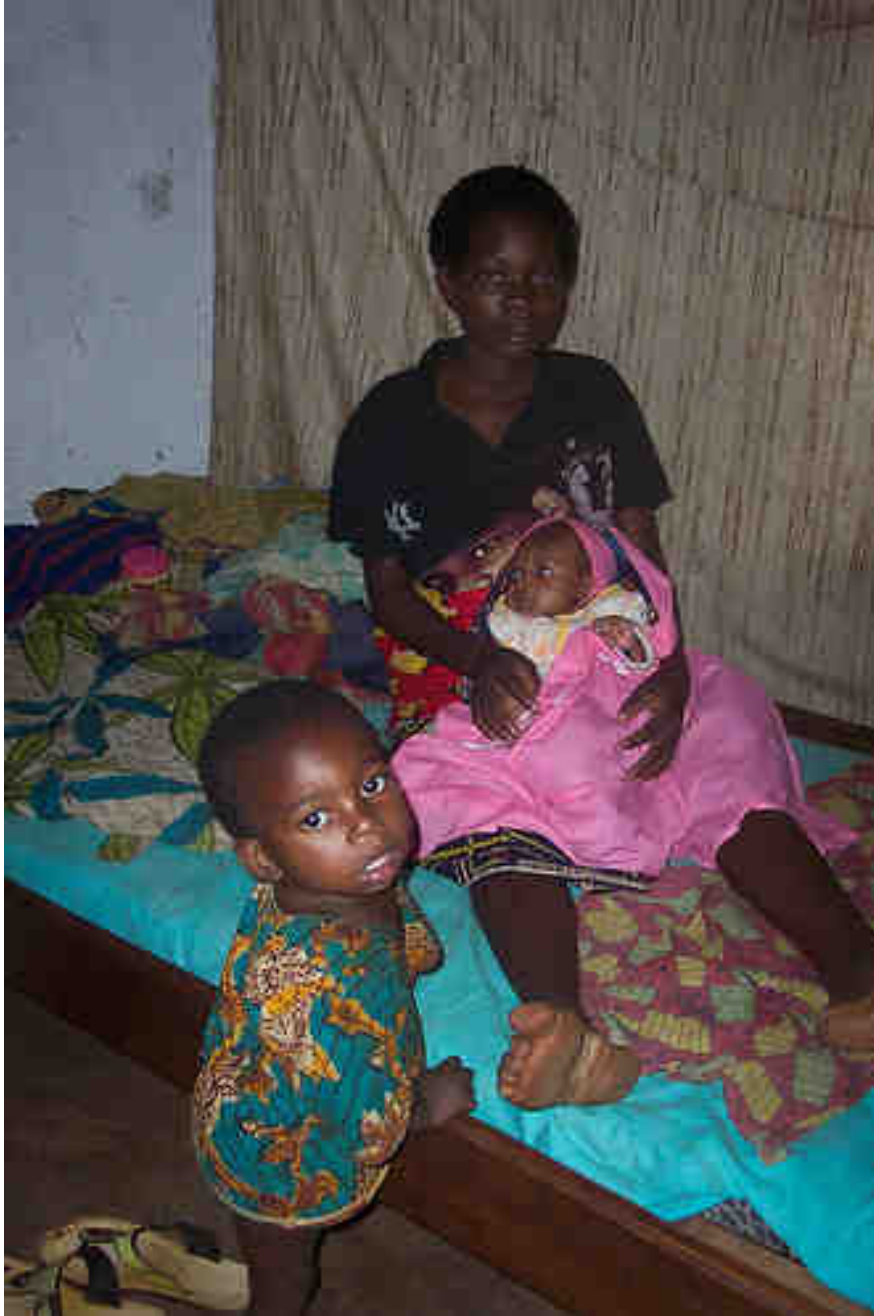
A new mother with her baby in the maternity ward