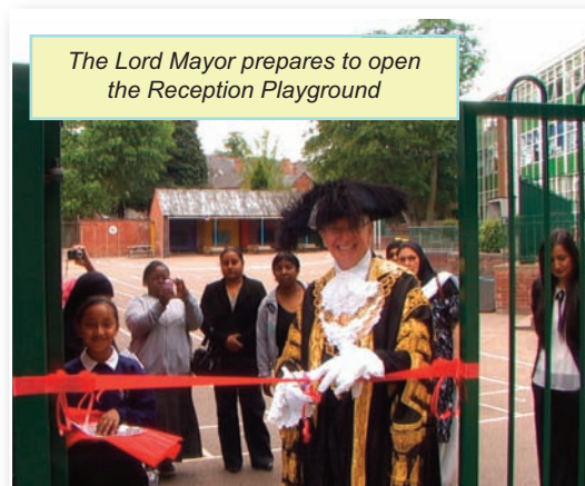
The Lord Mayor prepares to open the Reception Playground