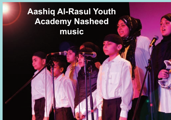
Aashiq Al-Rasul Youth Academy Nasheed music

Aston Vision had organised the project funded by the Community Development Foundation , which included workshops in Godly Play, Nasheed and & Gospel music, dance and drama, led by professionals in their various expertise.