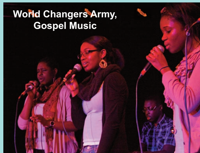
World Changers Army, Gospel Music

Jazba Entertainment had the difficult job of pulling it all together, not least, dealing with Birmingham City Council. Childrens Performance department, which resulted in cancelling one event.