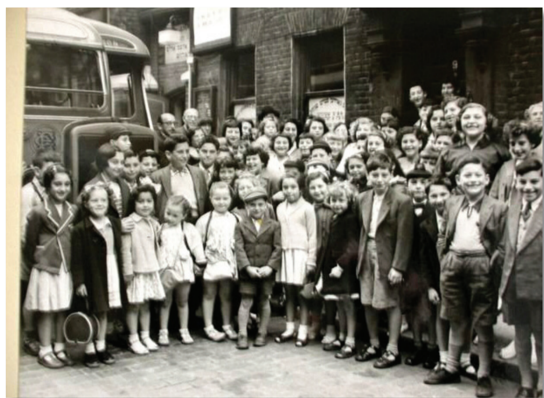
A group of Jewish children about to set off on a coach outing from Gt Garden St Synagogue