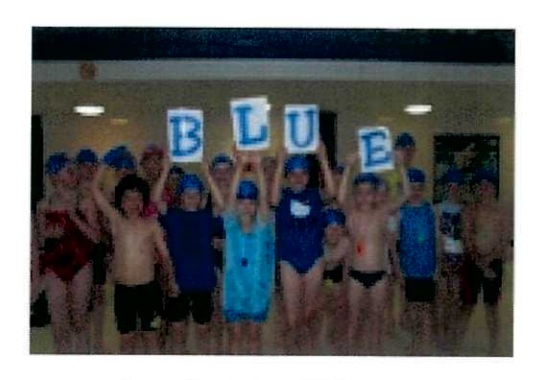
3 T's Gala - 3 July Winners - The BLUE Team