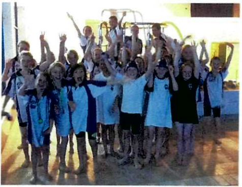
Canvey Island Gala 18 June