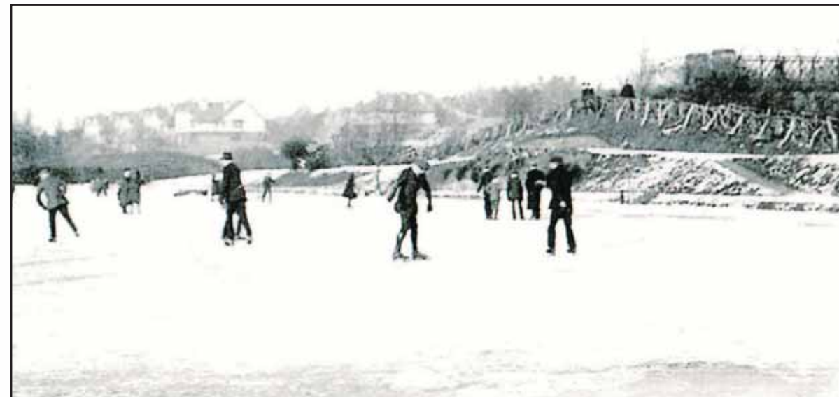
Skating on the lake, circa 1916

Skating was a regular occurrence when the lake froze over, lighting often being provided for illumination in the evenings. The photo shows skating during the winter of 1916.