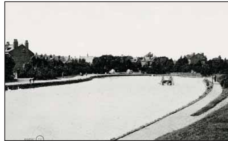
The Lake, circa 1906

The lake was edged with sandstone walling, much of which survives on the Westbourne Road side of the park. The depth is no more than waist deep. Periodically the water is drained out and weed, leaves and mud are cleaned out. An early feature was a duck platform or refuge which was built a few years after opening of the park. An island (still there today) was built in 1952 when cleaning was underway to provide a better refuge for birds.