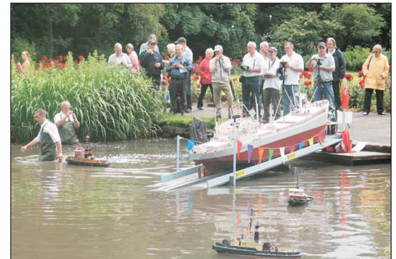
Wirral Model Boat Club 2008

Donated by the Hoylake and District Civic Society