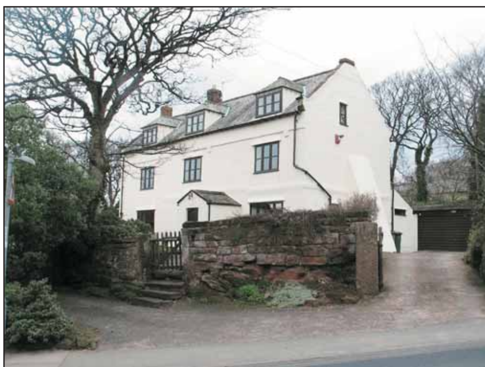
Manor Farm on Village Road