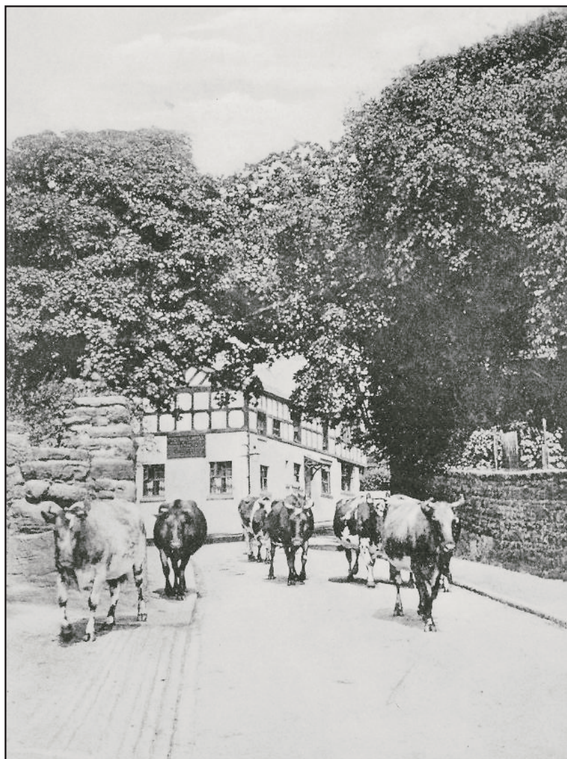
Village Road, West Kirby

Funded by Grant from the Wirral West Community Fund