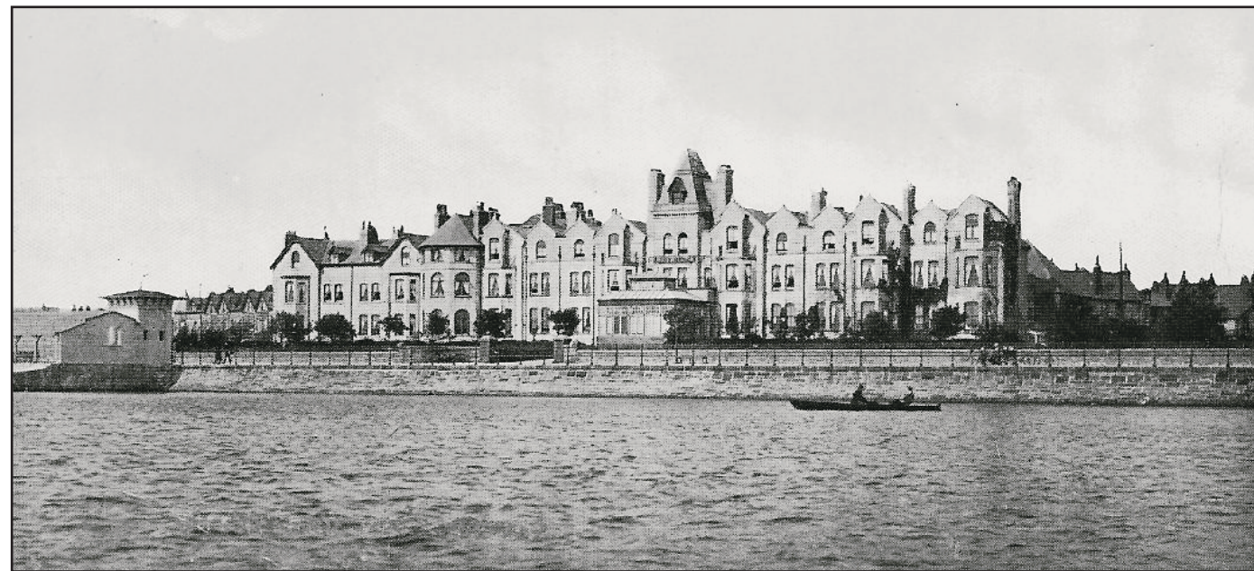
The Hydro, West Kirby 1890 - 1968

In 1890 the Hydropathic Hotel was built to host visitors especially those seeking the healthy sea air as a cure for ailments, the promenade followed in 1899, the Marine Lake in 1899 and electric lighting in 1901.