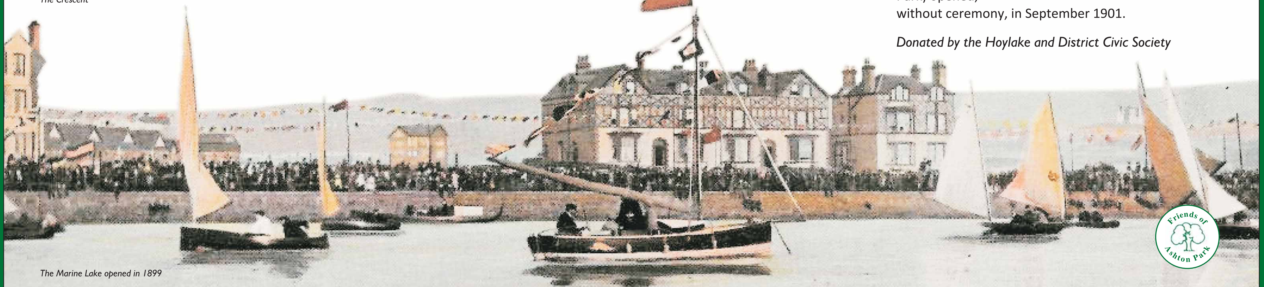
The Marine Lake opened in 1899

Donated by the Hoylake and District Civic Society