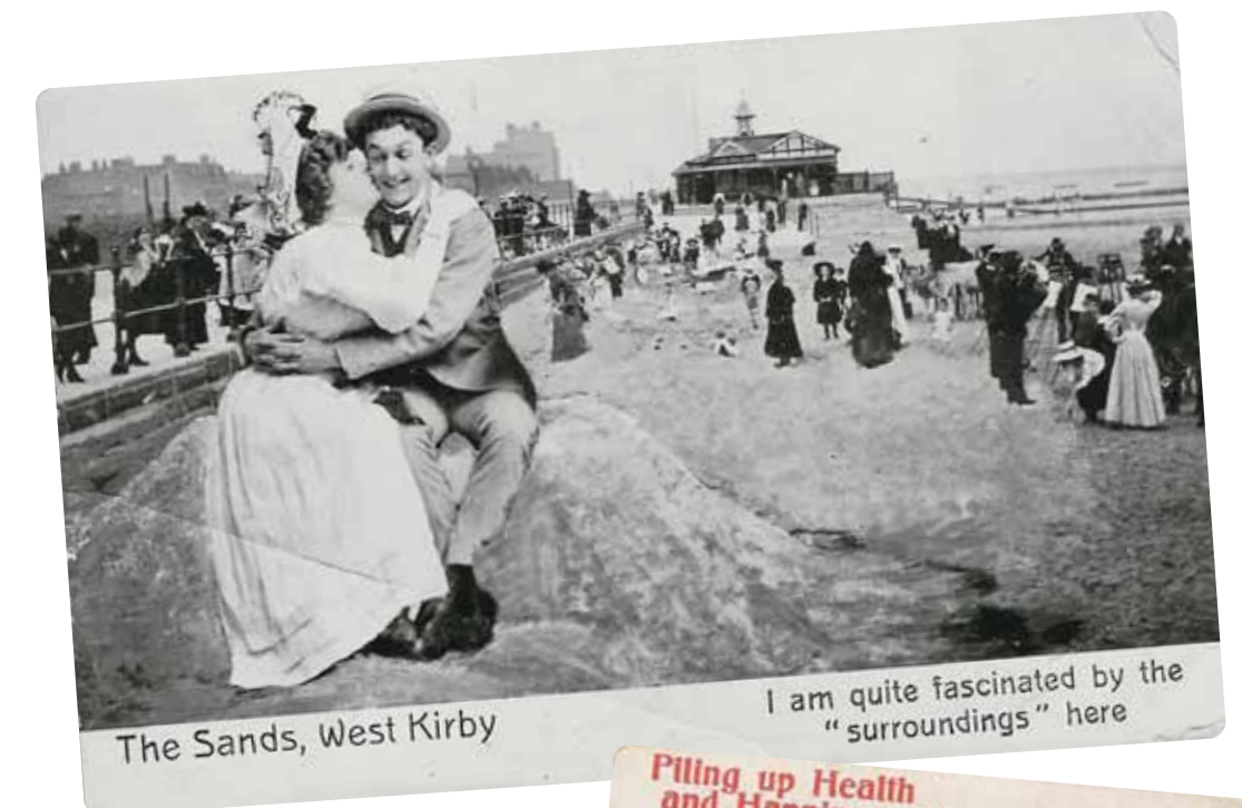
The Sands, West Kirby

Parks were seen as an important part of any developing town and city to promote the health and well-being of residents, provide entertainment and activities and attract visitors. The example of Birkenhead Park opened in 1847 must have been an inspiration for the opening of parks in Hoylake and West Kirby.