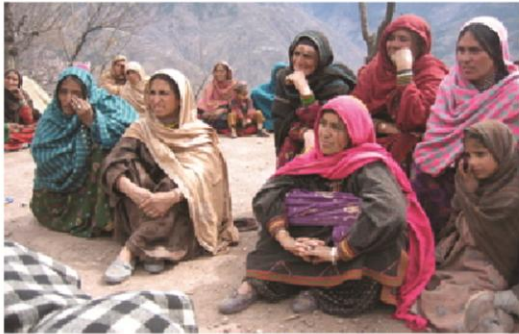
Women planning Khwendo Kor's work in their village