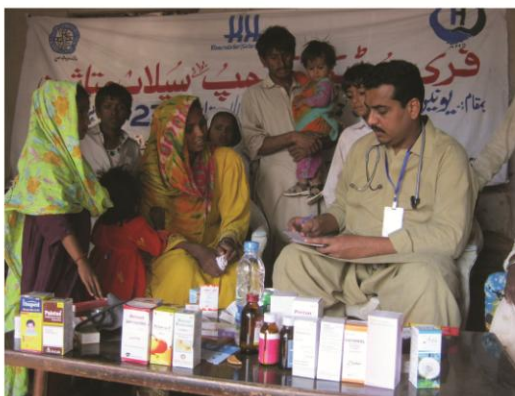
Attendance at one of the free medical camps organised by Khwendo Kor

FROK, 85 East Parade, York YO31 7YD Email: jonathanfrench97@gmail.com Tel: 01904 423522