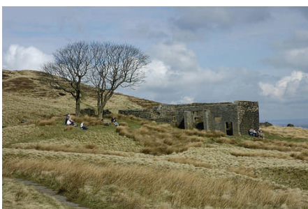
Wuthering Heights—Top Withens