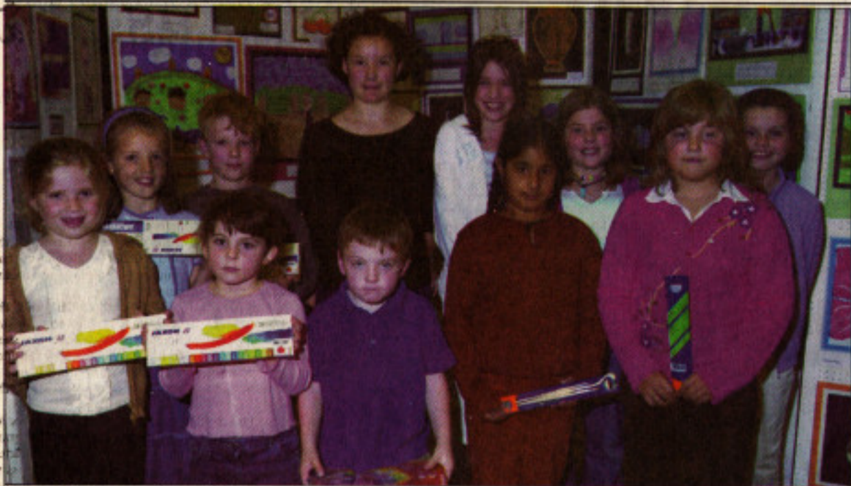
Some of the young winners in the art society's competition receive their prizes. AD40-28-03.