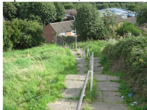
Figure 10. The steps leading down from the Forum Pub to Jenkin Avenue

To return to the Ridge follow the track back and approximately 40m from the earthworks you will see a path running off to the right and disappearing in to the trees. Take this path and follow it to a clearing looking out on the right hand side for a set of steps which will allow you to descend to Fort Hill Rd. When on Fort Hill Rd walk NW until you reach the steps down situated between Nos 55 and 53. Take these steps down and make for the Forum Pub then take the steps which run down the right hand side. Stop at the lamppost on the steps ( Figure 10 ) and resume the route as described above from (the Forum Steps to Sandstone Rd)