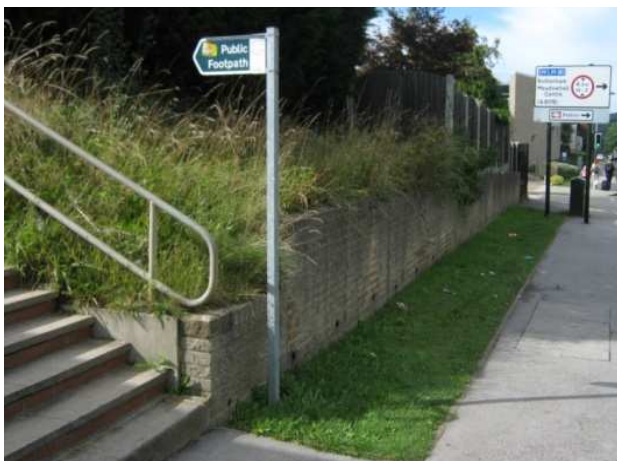
Figure 1 Footpath leading to Evesham Close

The walk is ideally planned for those reliant on public transport. Make your way to the Meadowhall interchange and exit to the north onto Tyler street. When on Tyler street cross the road and head North noting the wooded area on your left. This is a section of the Roman Ridge but is in a poor state and it is not possible to follow it further than 80m before it is terminated by industrial units. Continue north for 120m and take the public footpath ( Figure 1 ) to the left into Evesham Close. Continue up Evesham Close and veer left for 30m up Aylesbury Crescent. You will now see the footpath sign to where the accessible part of Roman Ridge begins.