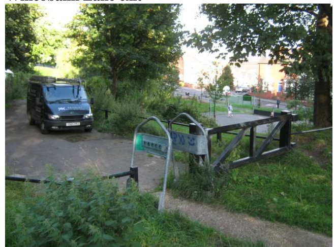
Figure 7. Wincobank Lane exit