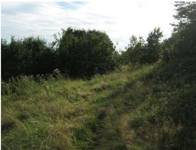
Figure 5. Explore the ridge by choosing a suitable path.

Whilst facing up the steps hop over (or under) the hand rail and make your way to the left along the unscheduled section of the Ridge (Figure 5). There are several paths to choose through this piece of land with some being easier than others. You will find yourself amongst dispersed oak woodland and areas of meadow flower. Keeping to the lower slope will avoid brambles and will allow you to appreciate the break of slope where the original profile of the Ridge can be seen now partially overlaid by groundworks from the houses built on Sandstone Rd. Make your way to Sandstone Rd.