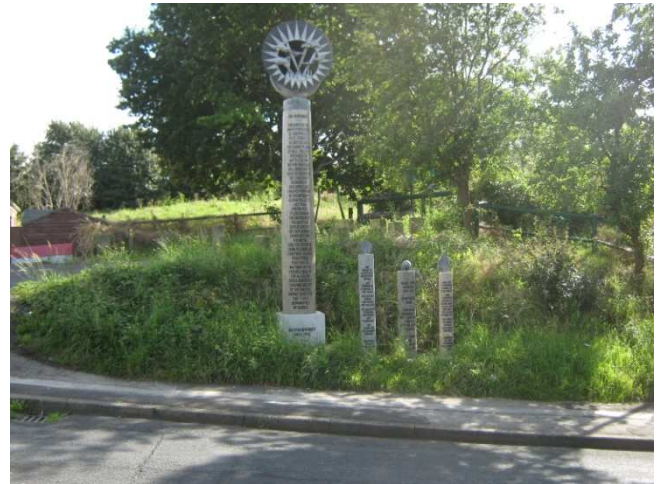
Figure 9. Posh Pillars next to entrance to the hillfort

To do this follow the yellow route across Wincobank Common to where it meets Jenkin Road again higher up. Cross this busy road carefully and continue up Jenkin Road till you see the modern commemorative artwork "Posh Pillars" next to the cobbled track of Winco Wood Lane leading to the hillfort ( Figure 9 )