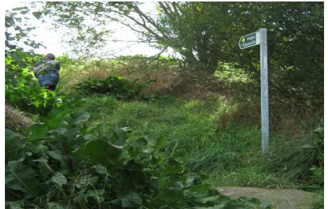
Figure 2 The footpath from Aylesbury Cres to the Ridge

Locate the footpath sign on Aylesbury Crescent and follow it up to the top of the bank. You are now standing on top of Roman Ridge. Looking back you will have good views of Rotherham and the M1 valley. You should be able to follow the line of the ridge in both directions as you walk up the hill.