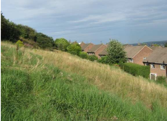
Figure 4. Looking North along the ridge behind Jenkin Ave.

Walk up to the first lamppost. To your right you can see the scheduled section of the ridge (Figure Four).