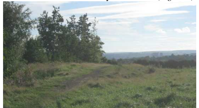
Fig 6. The exposure of Parkgate sandstone which forms the ridge

From this point the ridge can be identified as the bank which forms the SE boundary of this field (Figure 6).