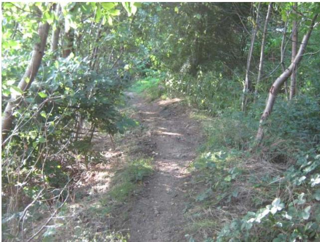
Figure 8. The woodland path overlooking Upwell St.

For those wishing to explore the steep slopes on the south-west of the hill the purple route will provide a good vantage point over Upwell and Wensley St. Proceed to the around the hedge line of the lower field keeping the hedge to the left until you arrive at the west corner. Carry on along the path amongst the trees ( Figure 8 ).