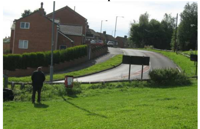
Figure 3. Wincobank Common where the Ridge meets Jenkin Rd

As the Ridge meets Jenkin Rd at Wincobank Common you can decide whether to follow the line of the Ridge or divert to the right up to the Hillfort (*See notes at end). To skirt along the lower bank of the ridge cross the road and proceed along Jenkin Avenue. The scheduled section of the ridge is behind the houses. Continue to number 82 where you will see steps leading up the hill.